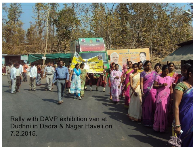
Rally with DAVP exhibition van at Dudhni in Dadra & Nagar Haveli on 7.2.2015.

DFP Gujarat region organized eight special programmes in six critical districts of the region. Seven of the programmes were organized in five districts of Gujarat including two each in Rajkot and Ahmedabad while one programme was organized in UT of Dadra & Nagar Haveli. UT of Daman & Diu is proposed to be covered in the next phase. A total of 8 rallies, 24 film shows, 42 oral communication and 30 photo exhibition programmes were organized as part of the campaign ,thus, targeting an audience of around 15 thousand directly. A total of 43 feedback reports were collected during the campaign. Most of the respondents were aware of the adverse sex ratio in the country and welfare schemes initiated by government for girl child.