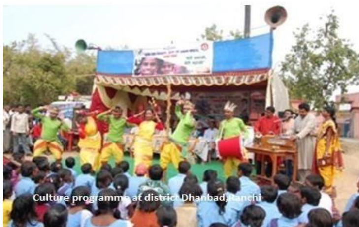
Culture programme at district Dhanbad, Jharkhand