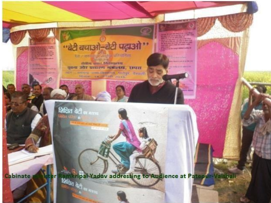
Cabinet Minister Ramkripal Yadav addressing to Audience at Patepur-Vaishali