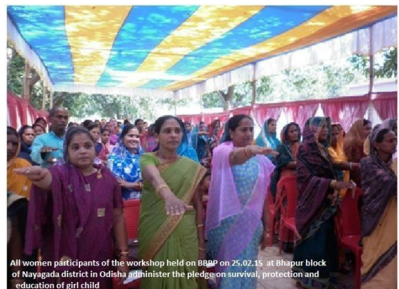
All women participants of the workshop held on BBBP on 25.02.15 at Bhapur block of Nayagada district in Odisha administer the pledge on survival, protection and education of girl child

In Odisha Region, two programs were organized at Odagaon and Bhapur villages in the critical district of Nayagarh by the Phulbani Unit. Around 2500 people were reached by the DFP Odisha region through the programmes in and around of the programme venue. Two mass rallies on BBBP were organized wherein PRI members, Block officials, ICDS officials, health workers, college girls students and other volunteers participated. Pledge on survival,