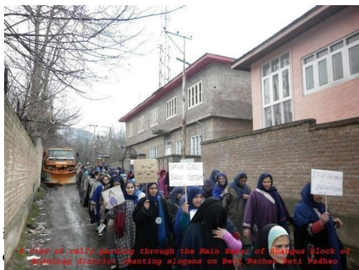
A view of rally passing through the Main Bazar of Sharnag block of Anantnag district chanting slogans on Behu 'Bachao Beti Padhao'

5 critical districts have been identified in Jammu & Kashmir Region .The identified districts are Jammu and Kathua from Jammu division and Pulwama, Anantnag and Budgam from Kashmir division. The region organized 10 awareness programmes on BBBP theme, 2 programmes in each critical district. Since 16 out of 22 districts in the state are under the arch every year, it is difficult to and programmes at grass root level. Frequent bandhs and strikes in Kashmir valley also hamper work. Despite all odds, 8200 people were reached and 141 feedbacks collected through these 10 programs.The programmes were attended by the District Development Commissioner, District Session Judge, Sub-Divisional Magistrate, Chief Education Officer, Chief Medical Officer, Child Development Project Officer, Principals of the School.