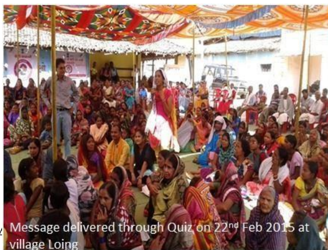
Message delivered through Quiz on 22 nd Feb 2015 at village Loing

In the Chhattisgarh Region, two programs were organized in the critical district of Raigarh. The Sex Ratio in the State is higher as compared to the national average of 918. Almost 40 feedbacks were collected in the two programs. 2700 people attended these programs. Union Steel & Mines and labour Minister Shri Vishnu DeoSai was the Chief Guest at the program in his adopted village Sunitee Satyanand Rathia. The other program was organized in the village adopted by MLA Shri Roshan Lal Agarwal. Print media coverage of the programs amounting to Rs.38,820 was generated through these campaign .