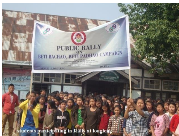
students participating in Rally at longleng

Total four programs were organized on BBBP in two critical districts of Longleng (Nagaland) and Senapati district (Manipur). Overall 20 feedbacks were collected and more than 800 people were reached. Village Council Chairperson, Village Development Board secretaries, Student leaders, NGOs, Child welfare Committees, Juvenile Justice Board, and Special Juvenile police Unit, District administration etc participated in the