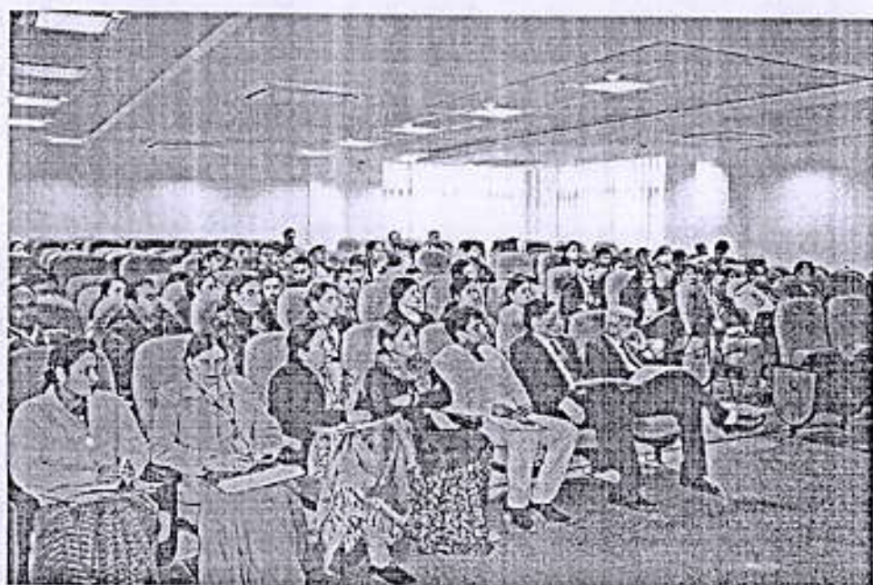
Participants during the Workshop