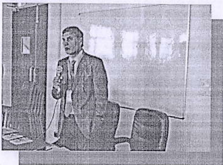
Guest speaker giving lecture