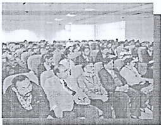
Audience listening to the speaker