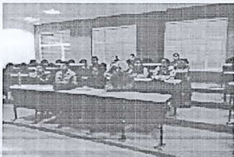
Audience listening to the Speaker