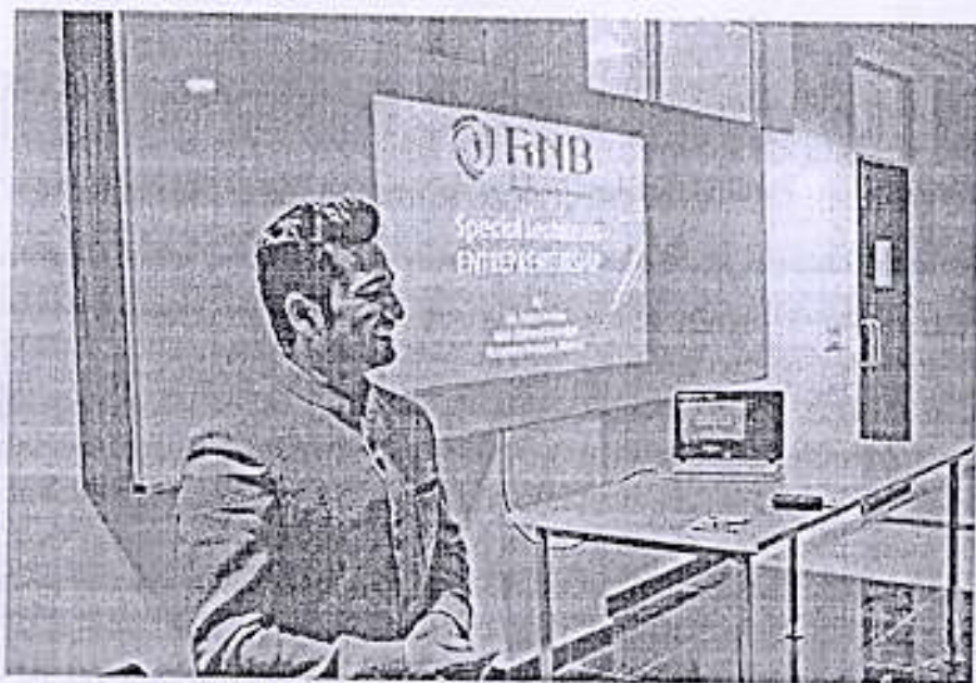
Speaker of the event Addressing the participants with his views