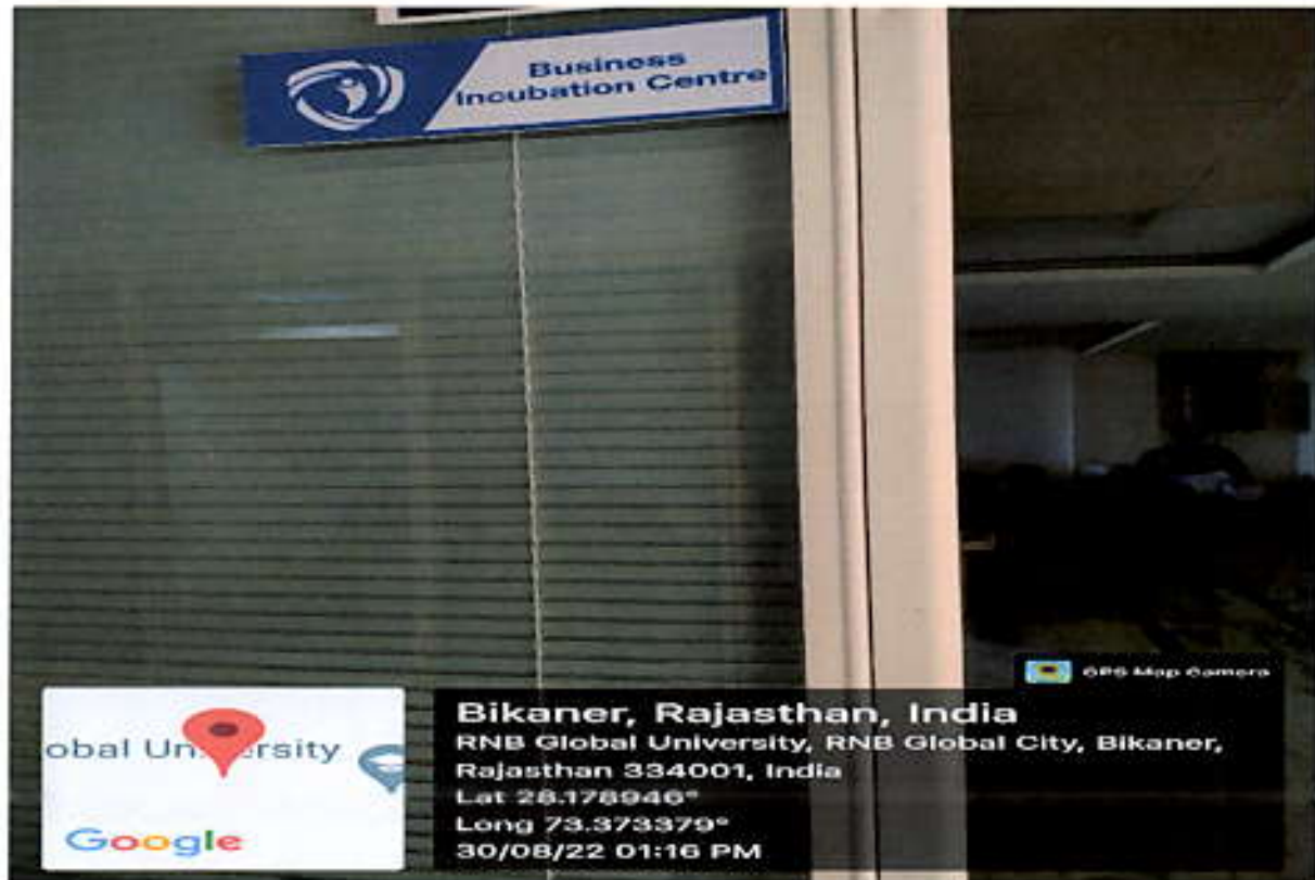
Incubation & Entrepreneurship Cell