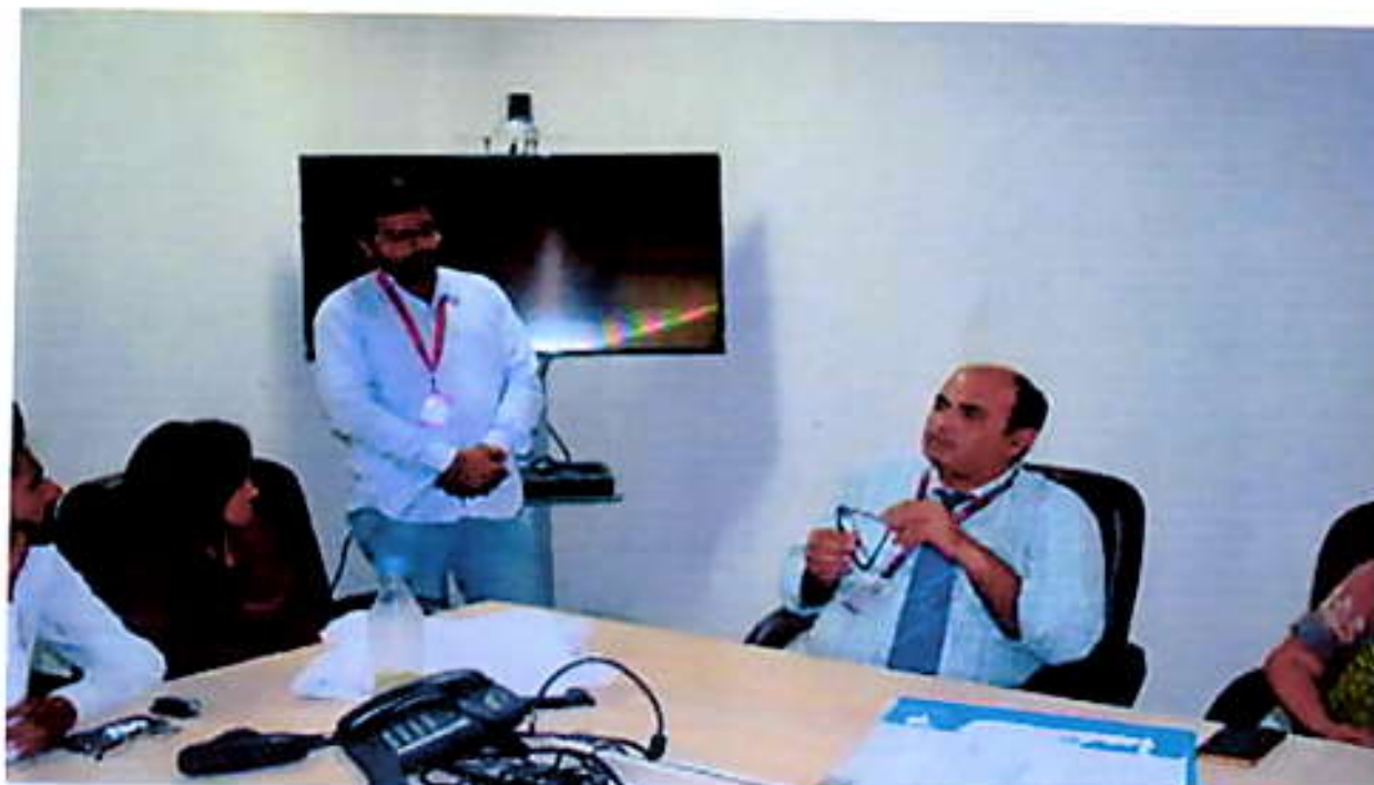
Start-up Presentation by Students