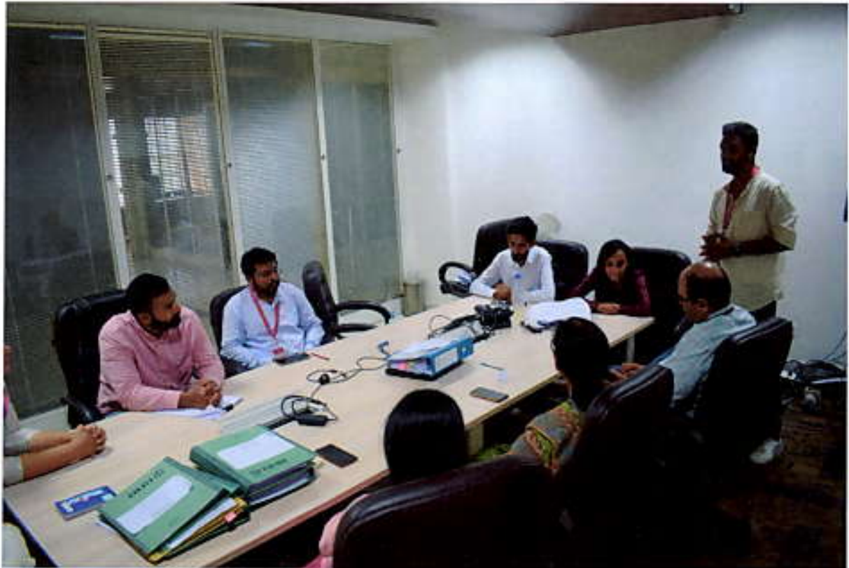
Incubatees Giving Presentation in Front of Panel Members