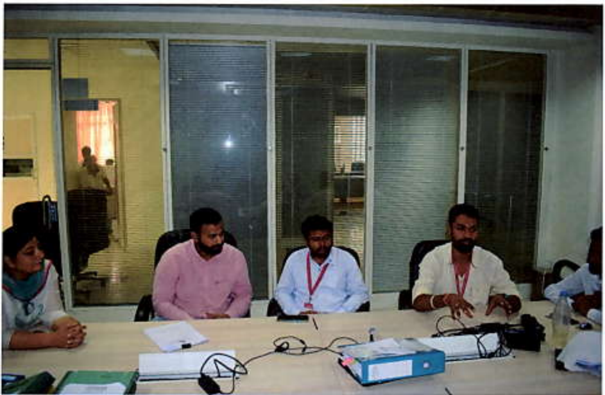
Incubatees Giving Presentation in Front of Panel Members