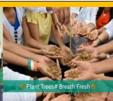
Plant Trees# Breath Fresh