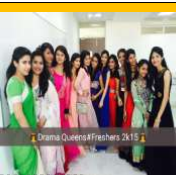
Drama Queens#Freshers 2k15