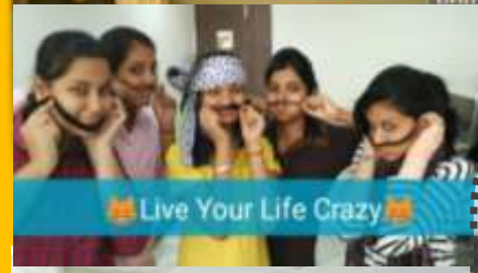
Live Your Life Crazy