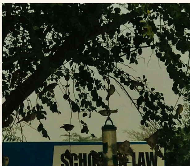
Beautiful Birds in RNB Campus Abhishekh Verma BCA II Sem