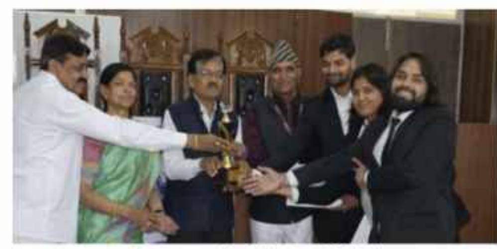
Runner-Up Team (2024)