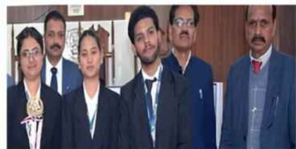
Winner Team (2025)