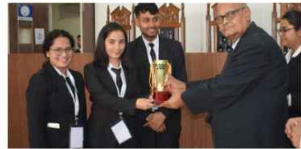
Runner-Up Team (2023)