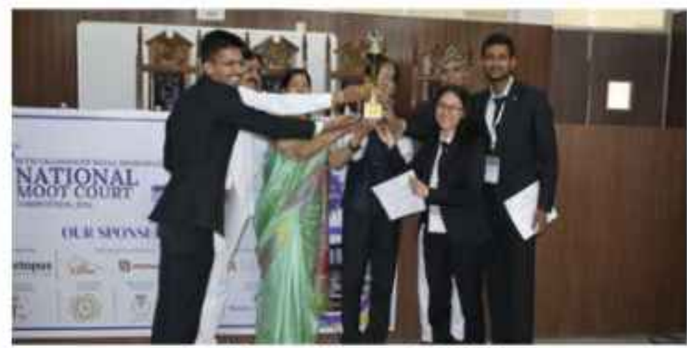
Winner Team (2024)