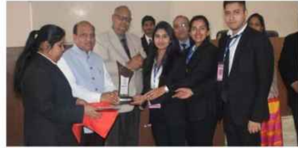
Runner-Up Team (2017)