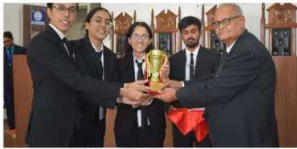
Winner Team (2023)