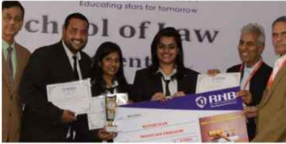
Winner Team (2017)