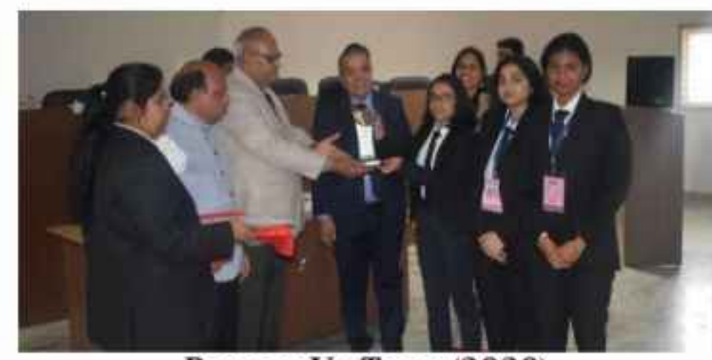
Runner-Up Team (2020)