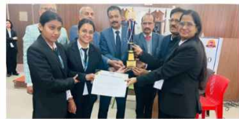
Runner-Up Team (2025)